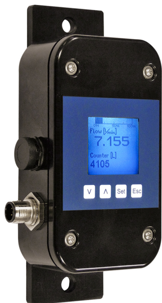
Remote display unit for BAMOFLONIC - PFA

EC Conformity: The instrument meets the legal requirements of the current European Directives